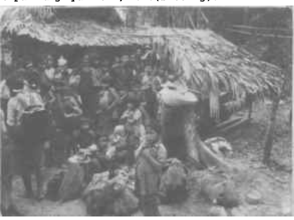
New arrivals of refugees at Somo camp aftervery strenuous escape.