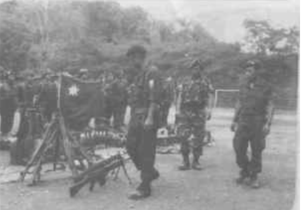
General Hla Htoo, A.G, inspecting the captured arms and ammunitions.