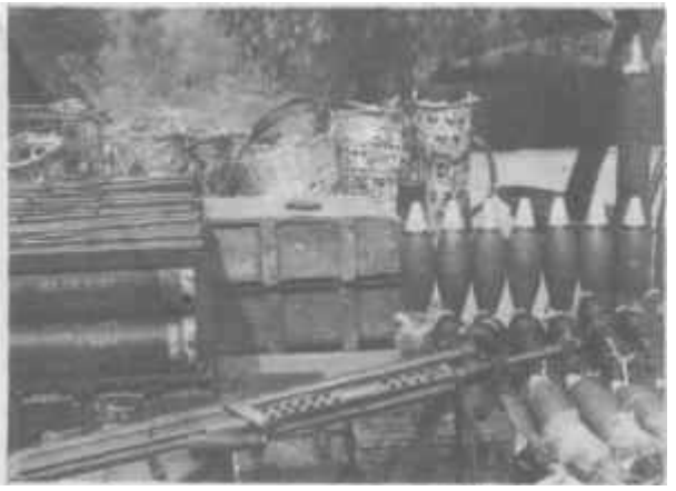
Some of the shells and ammunitions captured at Derlu ridge, 15-4-86.