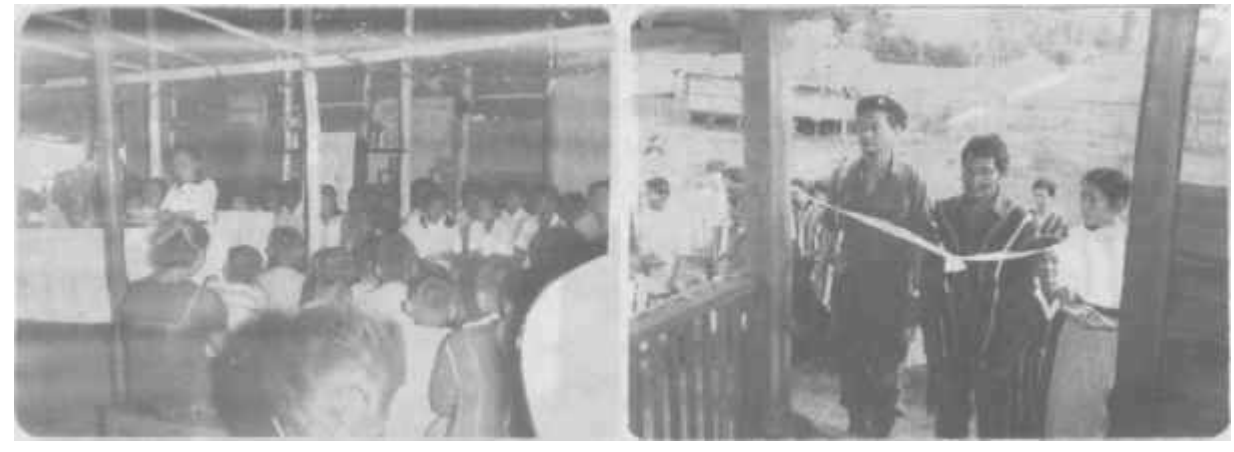
Youths at Christian Endeavour Service, Kawmoorah.