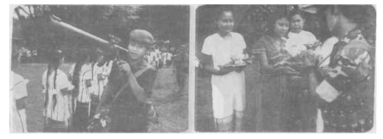
The Central State High School girls welcoming the victorious KNLA troops who captured No.70 infantry Bn.post at Pyinmabinseik.