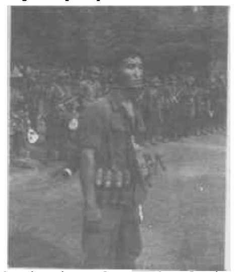
The victorious column at the welcoming ceremony .

Some of the Central State High school girls welcoming the victorious column.